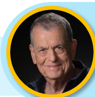
Prof. Aaron Ciechanover

Distinguished Technion Research Professor The Rappaport Faculty of Medicine and Research Institute Technion – Israel Institute of Technology, Haifa, Israel